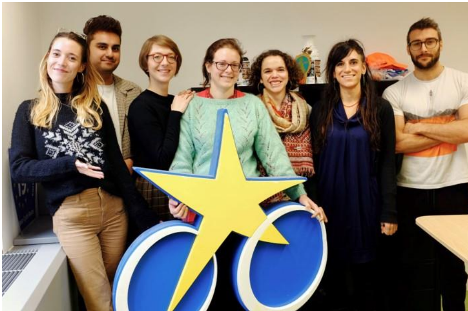
EuroVelo Management Team in November 2022