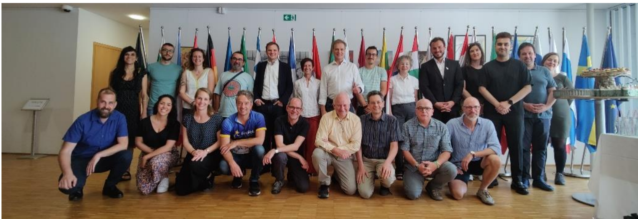
EuroVelo General Meeting in Ljubljana, Slovenia, in June 2022

The largest-ever edition of the EuroVelo General Meeting (EVGM), the annual meeting of the National EuroVelo Coordination Centres (NECCs), took place on 13 June in Ljubljana (relevant article available here ), in the margins of the Velo-city conference. Over 50 participants attended in person or online. Austria upgraded from an NEC to an NECC bringing the total of NECCs to 14, with nine National EuroVelo Coordinators invited to upgrade. The EuroVelo Management Team also continued sending NECC Broadcasts to provide targeted information every other month and organising specific webinars to share knowledge and experiences (two in 2022 on TEN-T and Marketing best practices, as well as three GIS subgroup online meetings).