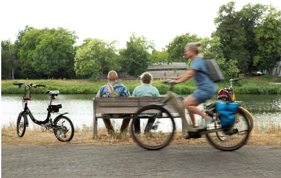
Maastricht, the Netherlands, along EuroVelo 19 – Meuse Cycle Route

EuroVelo continues to benefit from EU funding, and we participated in the final meetings of two projects in 2022: BICIMUGI and ECO-CICLE. A one-year extension of the AtlanticOnBike project was granted in February 2022. It focused on EuroVelo 1 – Atlantic Coast Route and involved partners from the six countries along the route. It started in June 2022 with the first project meeting in Bristol, UK. We also benefited from a seed money grant with a view to preparing a project application for EuroVelo 10 – Baltic Sea Cycle Route in 2023. At the end of 2022 we received the good news that a project application for EuroVelo 13 – Iron Curtain Trail was successful and would start in 2023: ICTr , in which ECF is a project partner. EuroVelo 13 – Iron Curtain Trail is certified as Cultural Route of the Council of Europe since 2019.