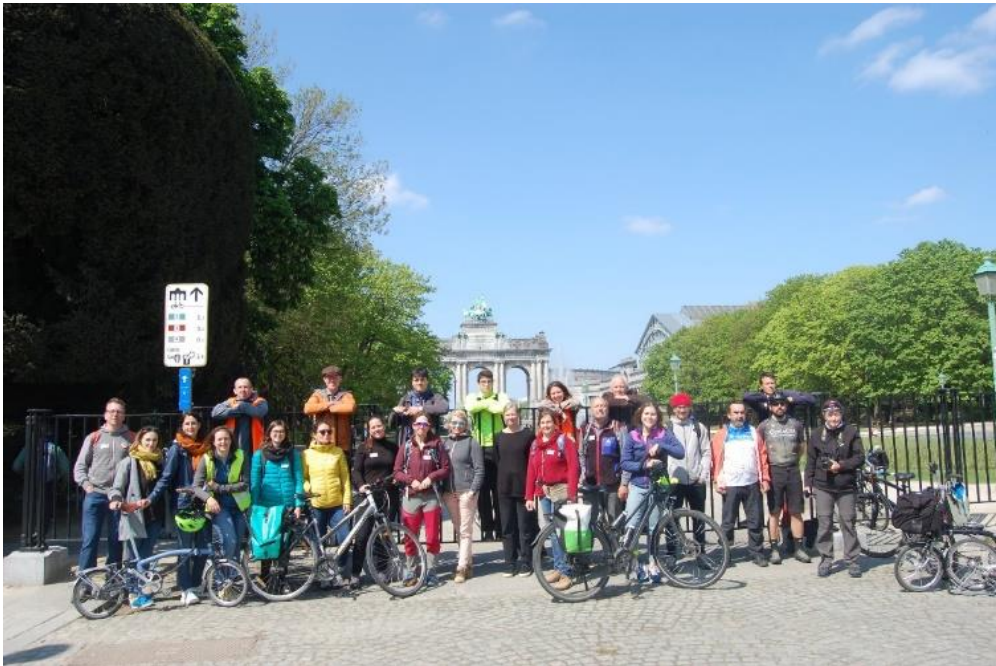
EuroVelo Route Inspectors' Training group picture in April 2022 in Brussels, Belgium, along EuroVelo 5 – Via Romea (Francigena)

from various countries and partners. The methodology was also used on different route sections, such as EuroVelo 1 in Portugal within the AtlanticOnBike project extension and the Iberian Cycle Route, which is currently under development in Spain and Portugal.