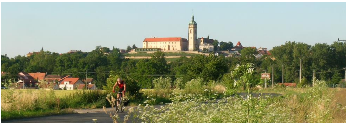
EuroVelo 7 – Sun Route in Czechia

The European Commission released its Transition Pathway for Tourism in February 2022, promoting a green and digital transition, and launched a call for pledges and commitments from tourism stakeholders. ECF submitted a pledge on EuroVelo in May 2022 committing to complete the EuroVelo network by 2030. One of 28 topics covered by the Transition Pathway for Tourism is “6. Sustainable Mobility” with 23 pledges on the topic in July 2023 out of 382 in total. On 1 December 2022, the Council of the European Union adopted the EU Agenda for Tourism 2030 . Within the conclusions, the Council of the EU invites Member States to support “the decarbonisation of mobility”, including the promotion of “active mobility modes, such as cycling and hiking, and encouraging longer stays”. EuroVelo and cycling tourism perfectly fit the strategy of both the European Commission and Council of the European Union but are not yet recognised as a high-potential tourism sector in itself. This will remain a focus for our advocacy work. Our Memorandum of Understanding with UNWTO also aims to put cycling tourism and EuroVelo higher on the political agenda.