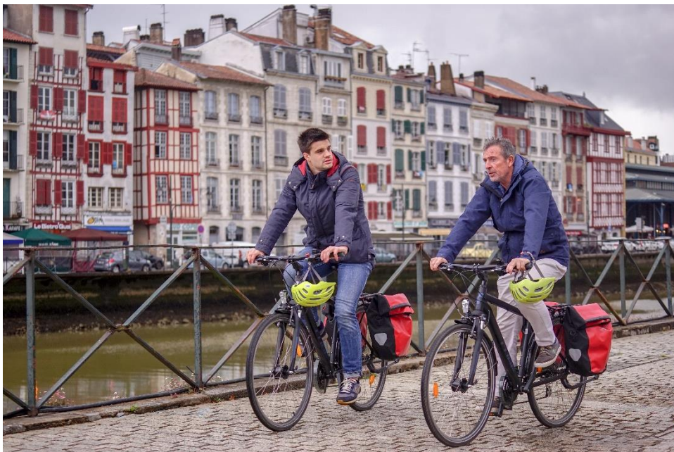
Bayonne, France, along EuroVelo 1 – Atlantic Coast Route

EuroVelo continues to benefit from EU funding, and we participated in the final meetings of two projects in 2022: BICIMUGI and ECO-CICLE. A one-year extension of the AtlanticOnBike project was granted in February 2022. It focused on EuroVelo 1 – Atlantic Coast Route and involved partners from the six countries along the route. It started in June 2022 with the first project meeting in Bristol, UK. We also benefited from a seed money grant with a view to preparing a project application for EuroVelo 10 – Baltic Sea Cycle Route in 2023. At the end of 2022 we received the good news that a project application for EuroVelo 13 – Iron Curtain Trail was successful and would start in 2023: ICTr , in which ECF is a project partner. EuroVelo 13 – Iron Curtain Trail is certified as Cultural Route of the Council of Europe since 2019.